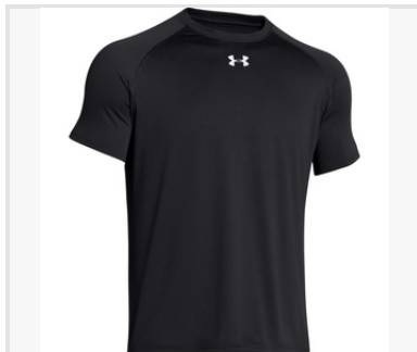
Under Armour Men's SS T-Shirt $25.00 UA Tech™ fabric with an ultra-soft, natural feel for unrivaled comfort Signature Moisture Transpor...

Items must be ordered by end of day 02/21/16. Items will be delivered to practice 2-3 weeks after store closes.