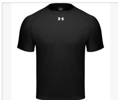
Under Armour Youth SS T-Shirt $22.00 Under Armour Youth Short Sleeve Locker Tee LOOSE:Full, loose fit for enhanced range of motion & ...