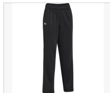
Under Armour Women's Sweatpants $45.00 These pants feature Armour Fleece fabric with has a brushed inner layer and a quick-drying, smooth o...