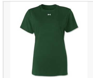
Under Armour Women's SS T-Shirt $25.00 Updated UA Tech™ fabric has a softer, more natural feel for incredible all-day comfort Signature M...