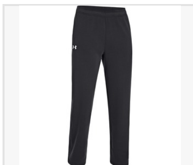
Under Armour Men's Sweatpants $45.00 Under Armour Men's Every Team's Armour Fleece Pant. The Under Armour Every Team's Armour Fleece Men'...