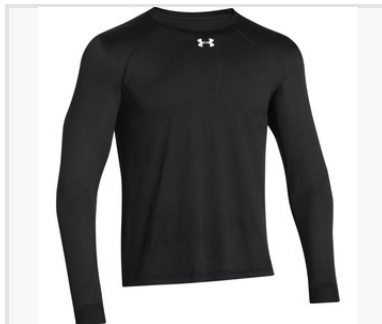
Under Armour Men's LS T-Shirt $30.00 UA Tech™ fabric with an ultra-soft, natural feel for unrivaled comfort Signature Moisture Transpor...