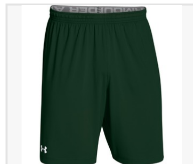
Under Armour Men's Shorts $25.00 HeatGear® fabric is ultra-soft & smooth for extreme comfort with very little weight UPF 30+ pro...