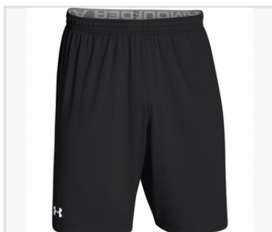
Under Armour Youth Shorts $22.00 HeatGear® fabric is ultra-soft & smooth for extreme comfort with very little weight UPF 30+ pro...